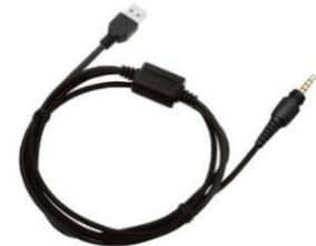
KPG-186U [W] USB PROGRAMMING INTERFACE CABLE (1-pin)