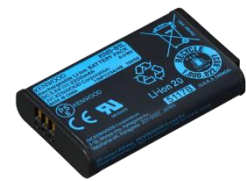
KNB-81L [W] Li-ion BATTERY PACK (3.6 V/2200 mAh)