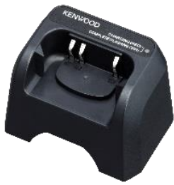
KSC-50CR B [W] CHARGER POCKET