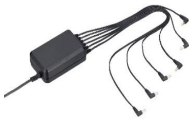
KSC-44ML [M] AC ADAPTER (EU Plug) (for Multiple Connected Charger up to 6 units) [AC plug may vary depend on the region]