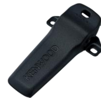
KBH-14 [M] BELT CLIP (Short)