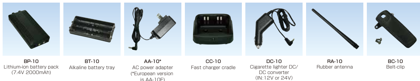
BP-10 Lithium-ion battery pack (7.4V 2000mAh)