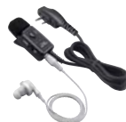
HM-153LA Lapel type microphone with earphone