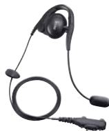
HS-94LWP Earhook headset with boom microphone for hands-free operation