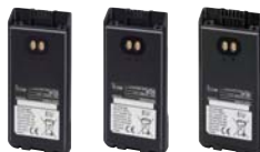
BP-278 BP-279 BP-280