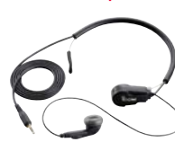
HS-97 + VS-4LA or OPC-2004LA* Throat microphone with earphone

* Either VS-4LA or OPC-2004LA is required when using HS-97 headset. VS-4LA: PTT switch cable for manual PTT operation OPC-2004LA: Plug adapter cable for VOX hands-free operation HS-94 and HS-95 also can be used with either VS-4LA or OPC-2004LA.