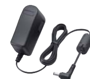
AC adapter BC-123SE/SUK*