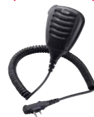
HM-168LWP IP67 waterproof speaker-microphone