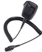
HM-159LA Full size durable speaker-microphone