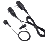
HM-166LA Light weight earphone microphone