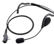
HS-95LWP Behind-the-head type with boom microphone for hands-free operation