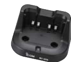
Rapid charger BC-213